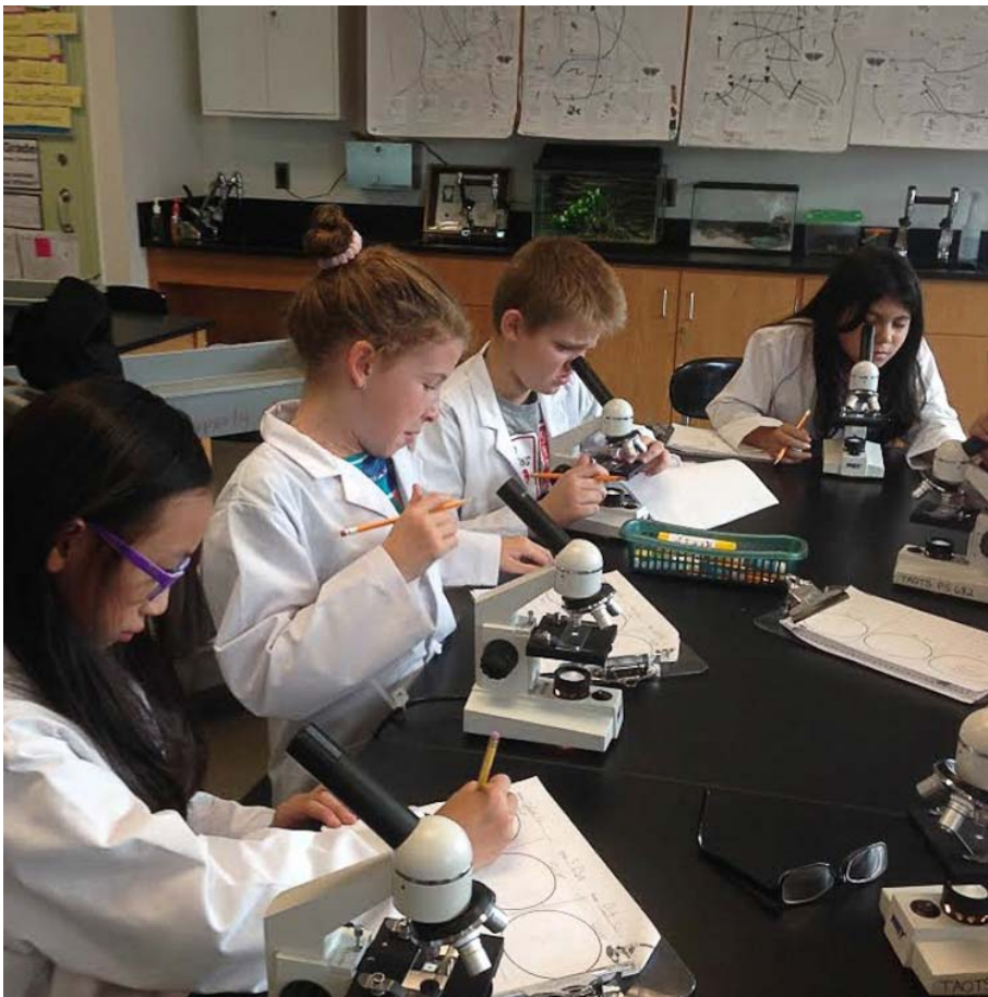
Students at P.S. 682 study biology.

I would like to congratulate the remarkable students, staff, and faculty of The Academy of Talented Scholars (TAOTS) for their exceptional academic performance over the past year. Brooklyn's P.S. 682 has been named a recipient of the National Blue Ribbon Schools award by the U.S. Department of Education, one of a select group of only 335 schools nationwide. For 33 years, the National Blue Ribbon Schools Program has recognized grade-schools, both public and private, for their exemplary performances in closing the achievement gap and instituting higher standards of education among their pupils.